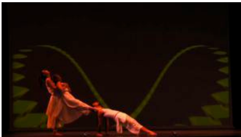
Dance Box Theater's Affectations at the Kennedy Center Millennium Stage 2010